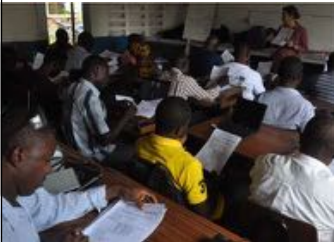
A women's specific solar classroom