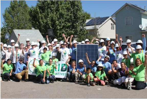
Fig. 2: The team of installers, volunteers and trainees involved in a community low-income solar installation.

Finally, the SASH Program promotes partnerships between private solar contractors and local workforce development programs by including a job training requirement for all sub-contracted SASH projects. This becomes a double benefit to low-income communities since many green-collar job trainees come from the same communities that the SASH Program aims to serve.