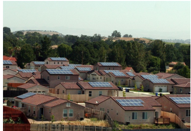
Fig.1 34 Solar installations in a low-income community in Templeton, CA.

Solar policies and programs are typically driven by renewable energy's broad community benefits, including environmental, local jobs and in-state economic growth, private investment in local industries, reduced electricity demand during peak periods, a diversified energy resource mix, and stabilizing the energy supply infrastructure. Making solar investments in low-income communities can help maximize many of these benefits since these communities often are the hardest hit with environmental challenges, high unemployment, and lack of private investment. Well-designed solar programs can provide broad reaching benefits for low-income families and communities. Fig. 1 represents 34 families in an affordable housing development in Templeton, CA which received solar through SASH.