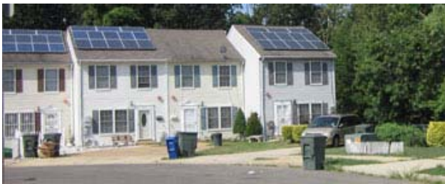
Fig. 5: Solar installations in Ward 8

Through this program, lasting connections were established between contractors, community members, and the DC SEU. When solar panels began to go up on houses in Wards 7 and 8, neighbors became interested in learning more about solar technology. The visibility of the Small-Scale Solar initiative enabled contractors to sell several systems at the market rate to District residents who were not qualified for the low-income installations. Fig. 5 demonstrates multiple installations on single family townhouses. Additionally, data from the solar arrays will inform future DC SEU programs and initiatives by providing real-time local electricity cost information.