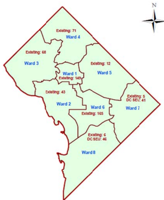
District of Columbia Solar Installations by Ward numbers

Wards 7 and 8. The DC SEU quickly exceeded this goal and expanded the program by 67 qualified participants. By November, 87 installations were completed. (Fig 4)