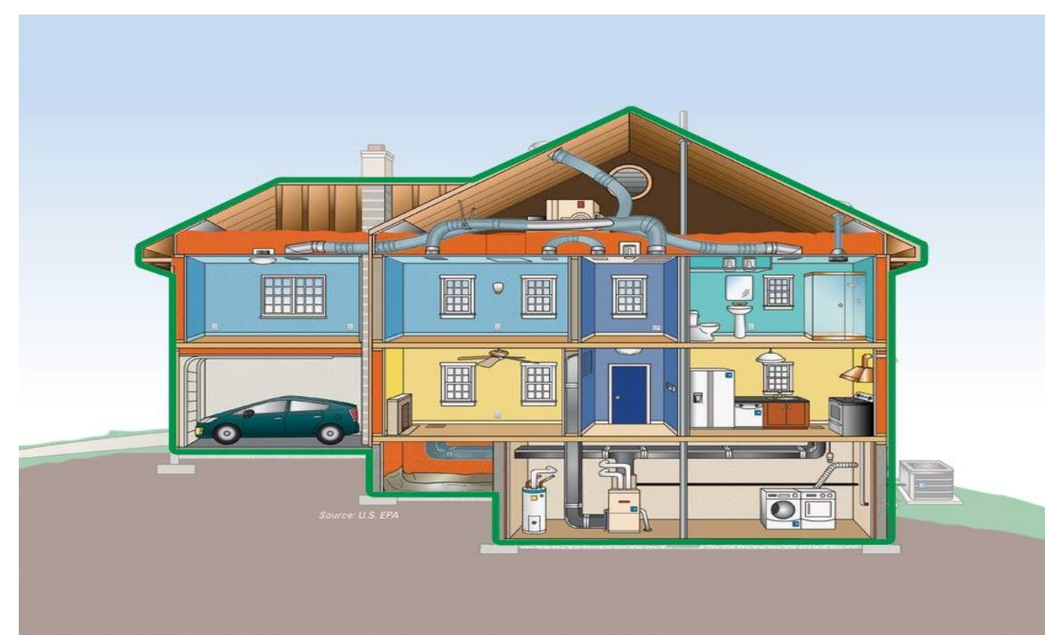
Fig. 1. Building Energy Efficiency, 2011 (DOE/EPA)

Many benefits are enjoyed by people who occupy a resilient, energy efficient building. During a power outage, inhabitants are not as uncomfortable or concerned about safety as in a conventionally designed building. Utility power bills are lower. With building power consumption reduced, the cost of a renewable energy supply to produce the needed power is also lower.