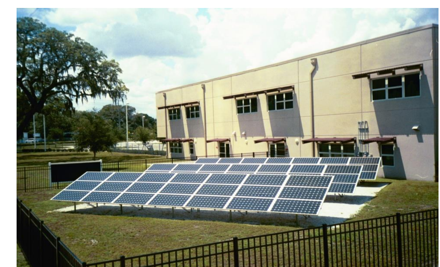
Fig. 3. Building Energy Efficiency, 2011 (DOE/EPA)

In 2003, the Florida Solar Energy Center implemented a DOE Solar for Schools Program which called for installation of PV systems on schools for educational purposes. By 2010, the educational mission was enhanced to a more meaningful objective to put PV on schools designated as shelters. The PV systems had a 10 kWp PV array connected to the grid with battery storage. This configuration was installed on 118 schools in Florida for solar education and emergency power. The SunSmart E-shelter for Schools became a real life, viable application, as shown in Fig 3. These utility interactive systems used a net meter connected to grid power to reduce the school's electric bill during normal times and to provide emergency power for critical/essential loads during utility outage. A critical load power panel for lights, communications, and special needs equipment was powered by the PV system during emergencies and normal times, as shown in Fig 4. The battery pack was kept full at all times to be able to provide emergency power through a bi-modal inverter for two days.