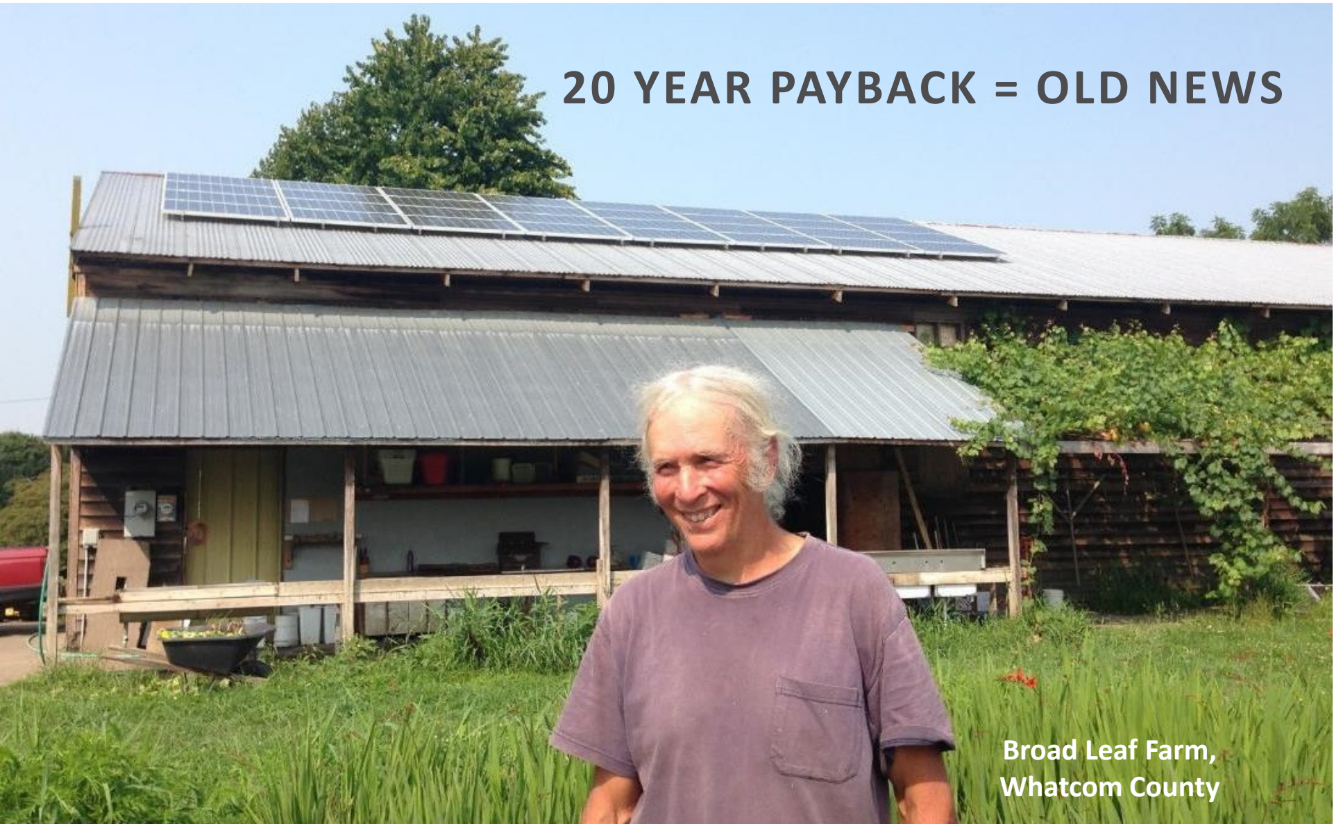
Broad Leaf Farm, Whatcom County